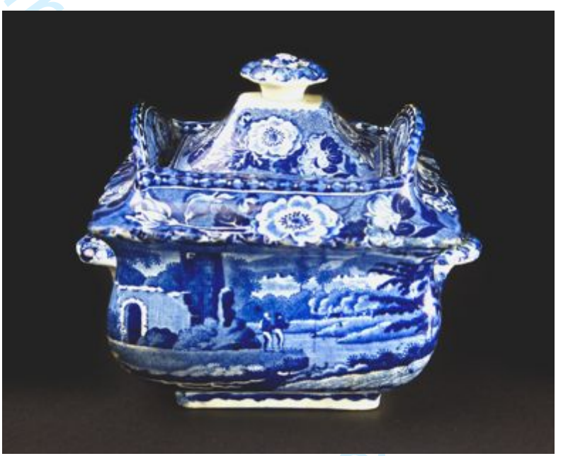
Source: Sugar, earthenware, blue printed, depicting two fishermen beside a ruin. This printed pattern occurs on wares manufactured by Enoch Wood & Sons, Burslem, Staffordshire, c1820s. Impressed mark "Field & Clark". See Figure 11.

[Figure 10: Sugar, Staffordshire, c1820s]