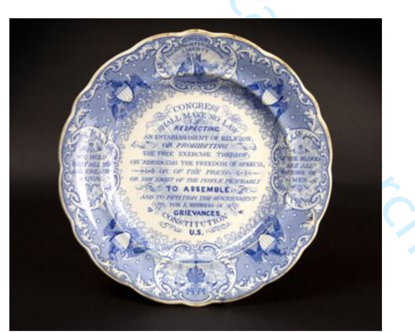
Source: Plate, earthenware, blue printed, "Lovejoy... Congress shall make no law...". Advertised by Thomas F. Field of New York, in 1838 Unmarked, Staffordshire, c1838.

[Figure 17: Elijah Lovejoy plate, Staffordshire, c1838.]