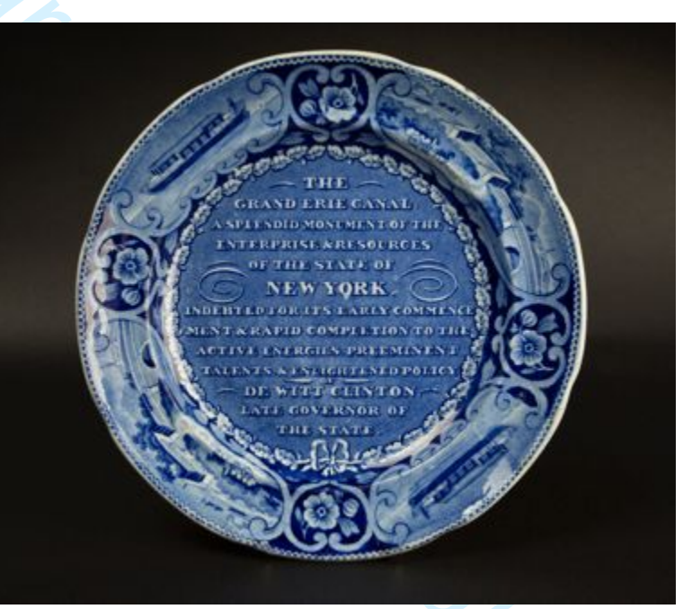
Source: Plate, earthenware, blue printed, "The Grand Erie Canal, A Splendid monument...". Wares with this inscription were advertised by Field & Clark of Utica, Statesman , New York, 15 June 1824. Unmarked, Staffordshire, c1824.

[Figure 12: Example of a plate, referring to Grand Erie Canal, advertised by Field & Clark.]