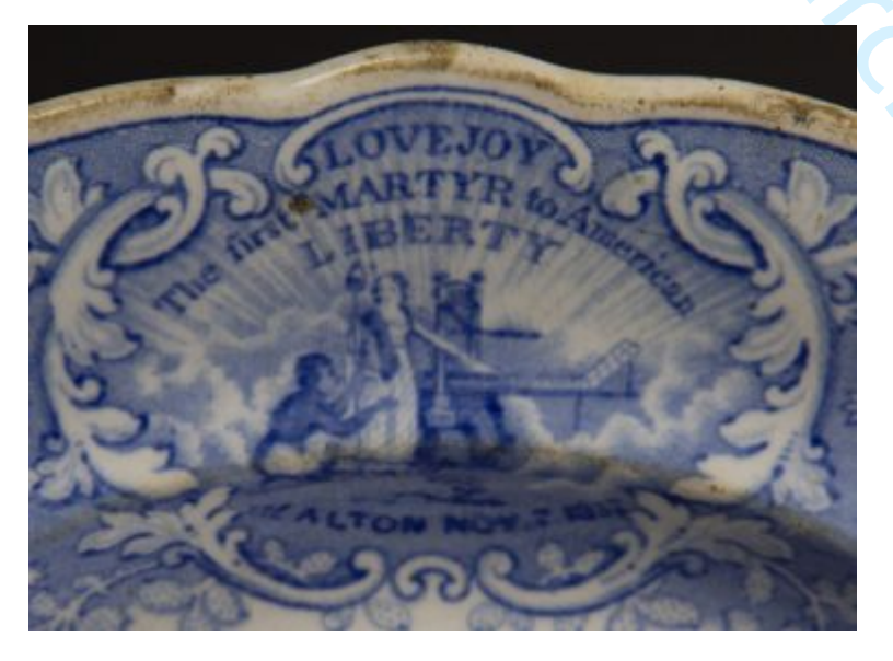
Source: Detail of Figure 17, depicting a printing press, a slave, and marked "LOVEJOY, The First Martyr to American LIBERTY, ALTON NOV.7. 1837."

[Figure 19 about here] [Figure 19: Detail of Figure 17.]